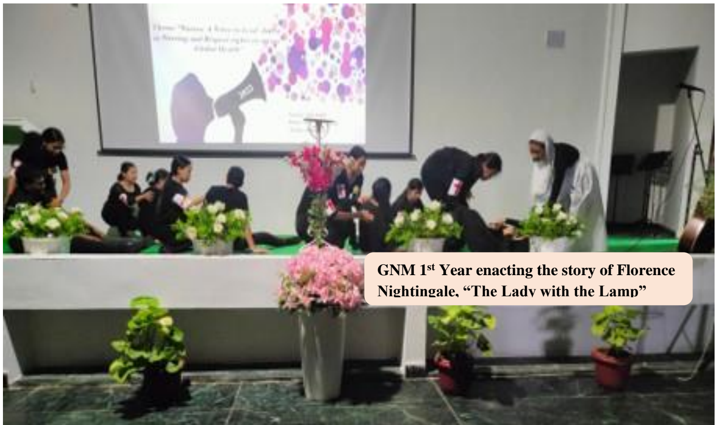
GNM 1 st Year enacting the story of Florence Nightingale, "The Lady with the Lamp"