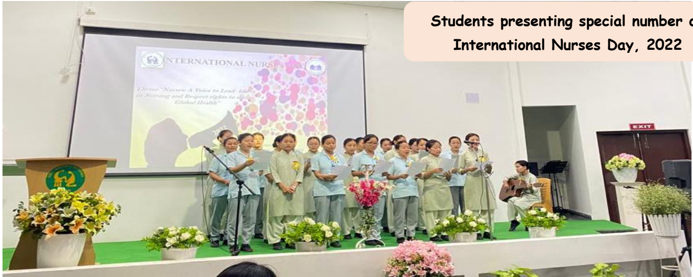
Students presenting special number on International Nurses Day, 2022