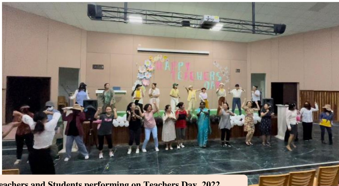
Teachers and Students performing on Teachers Day, 2022