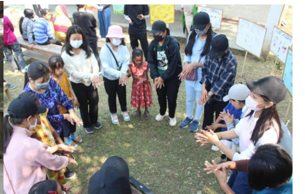
Providing health education in the community