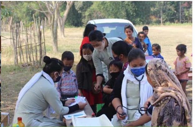
Conducting Health camp