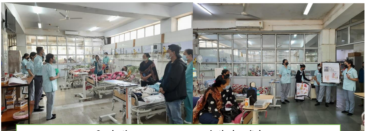
Conducting awareness program in the hospital