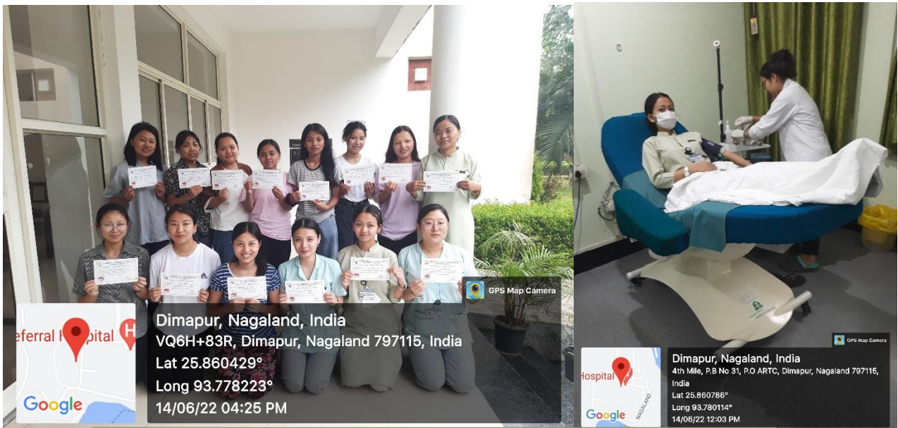
Voluntary Blood donation on World Blood Donor Day