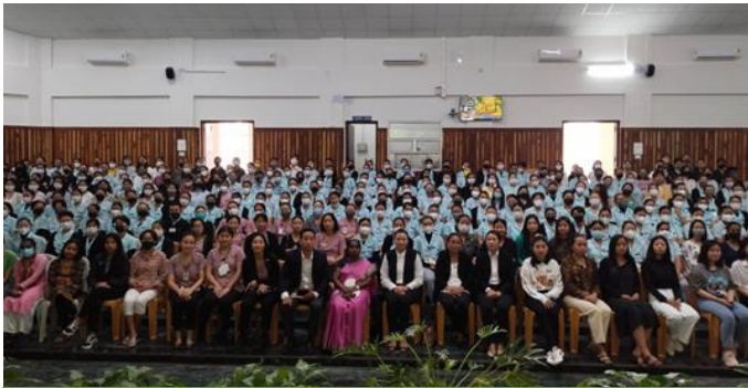
Attending awareness program on International women's Day