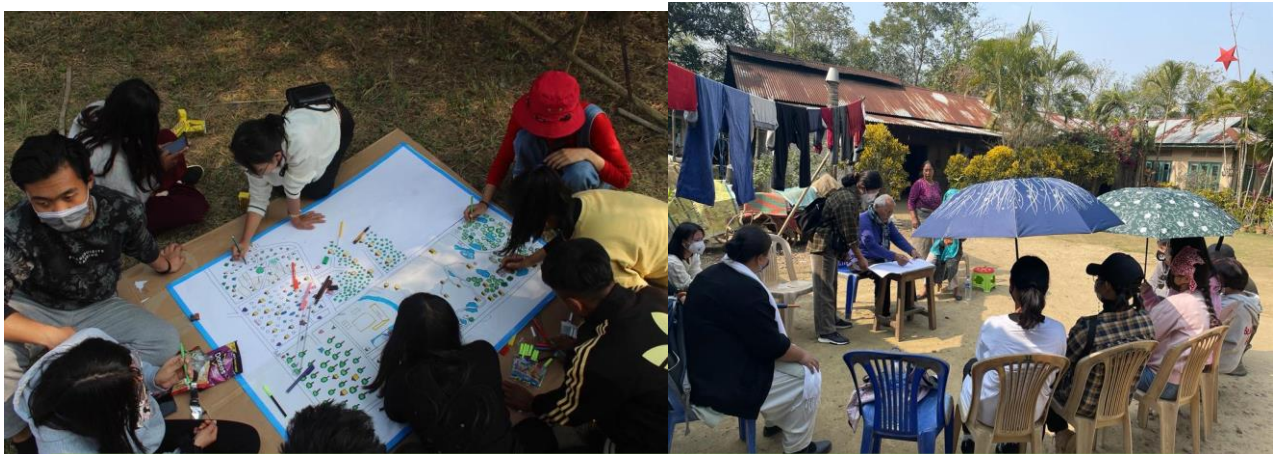
Survey, Resource Mapping and Group Discussion in the community