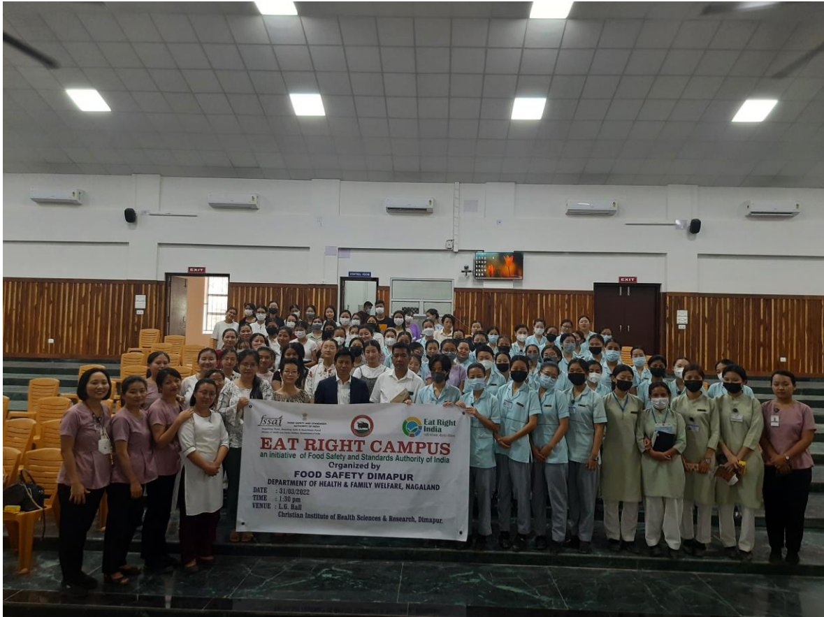
Attending a session on “Eat right campus” an initiative of Food Safety Standard Authority of India