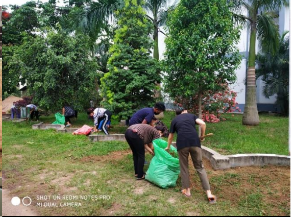
Campus cleaning and gardening