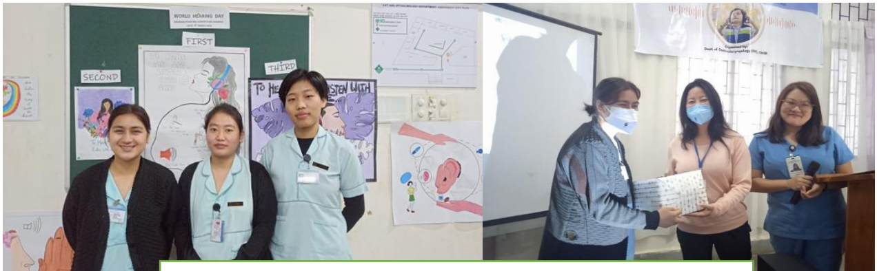
Participating in poster competition and winning prizes