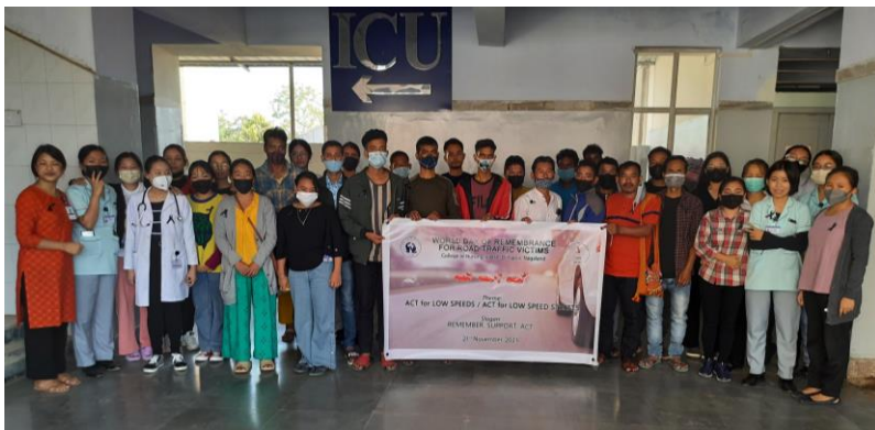
Conducting awareness program on "World Day of remembrance for road traffic victims"