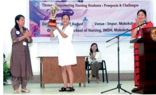
A nursing student from CIHSR lifts the champion trophy at the third state-level SNAI Meet 2023 held at Impur, Mokokchung.